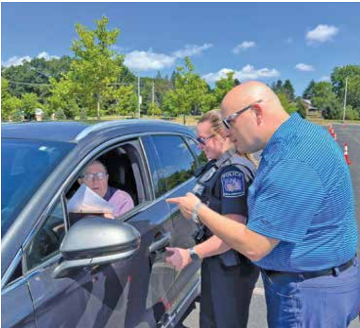
We serviced more than 100 applications for residents at our recent license plate replacement event in Monaca!